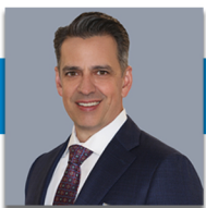
Hon. Tom Graves