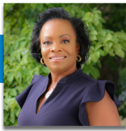
Mayor Beverly Burks