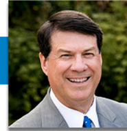
Mayor Rusty Paul