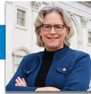
Hon. Carolyn Bourdeaux